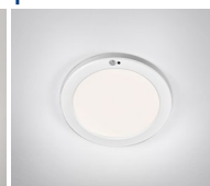
4000K: Cool white