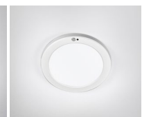
5000K: Daylight, bright white