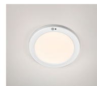
3000K: Soft white, yellowish