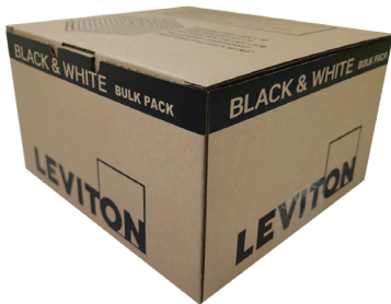
Bulk versions for high volume assembly