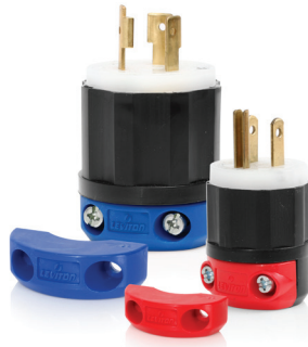
Colored cord clamps