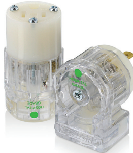
Hospital grade clear